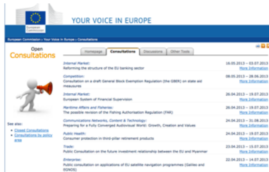
Your Voice in Europe

→ The exemple of the European Commission's online consultations