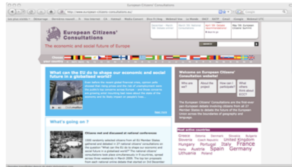
The European Citizens' Consultations